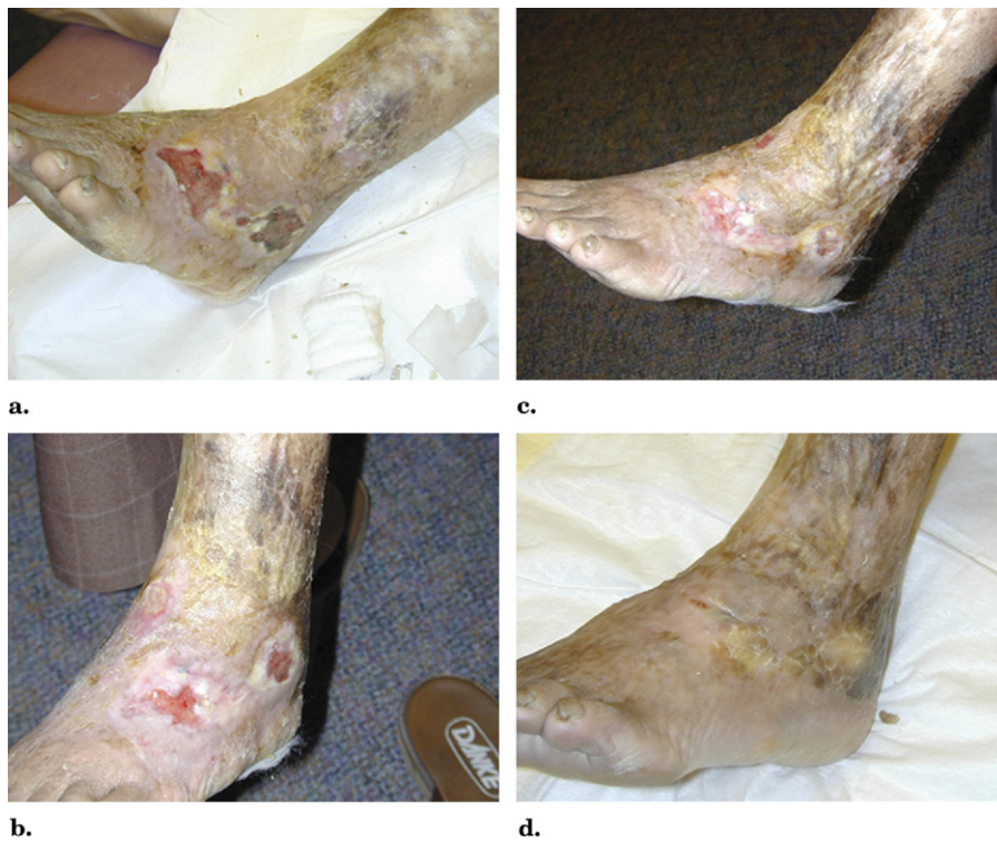
Figure 1. Photographs show healing of venous ulcer by 3 months. Images obtained before EVLT (a), 1 week after EVLT (b), 1 month after EVLT (c), and 3 months after EVLT (d).